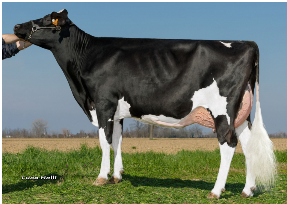
Mirabell S.S. Megathor