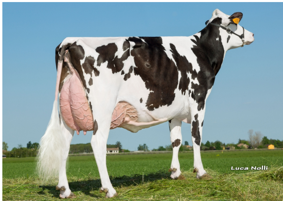
Zamagni Gr Malva VG85 - 2lact.